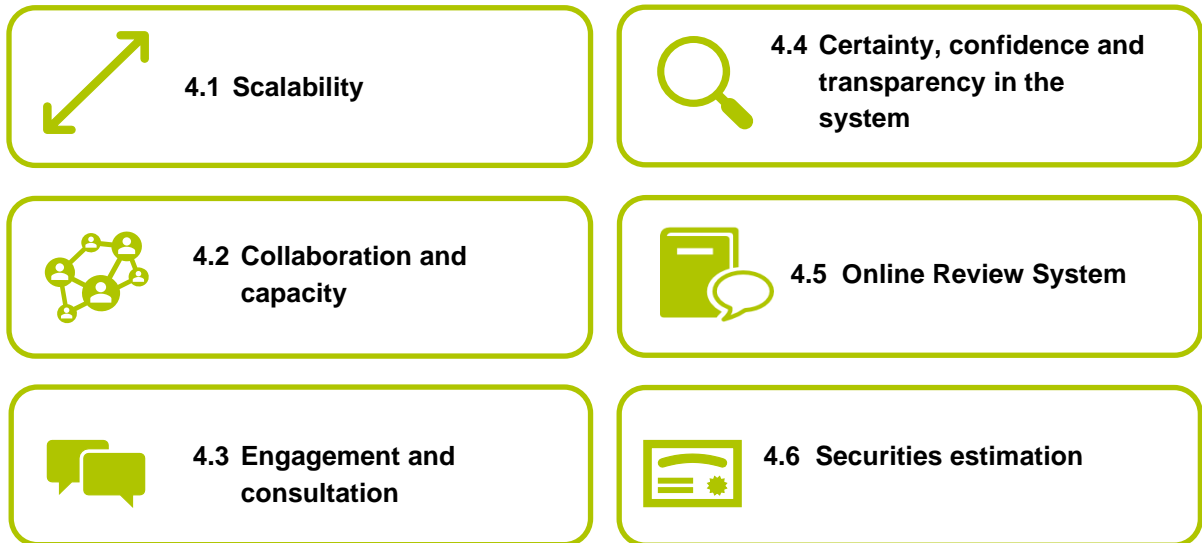
Figure 1: List of Key Issues

Throughout the workshop, participants identified a number of key issues related to information needed to process mineral exploration applications. A synthesis of the issues is described in this section.