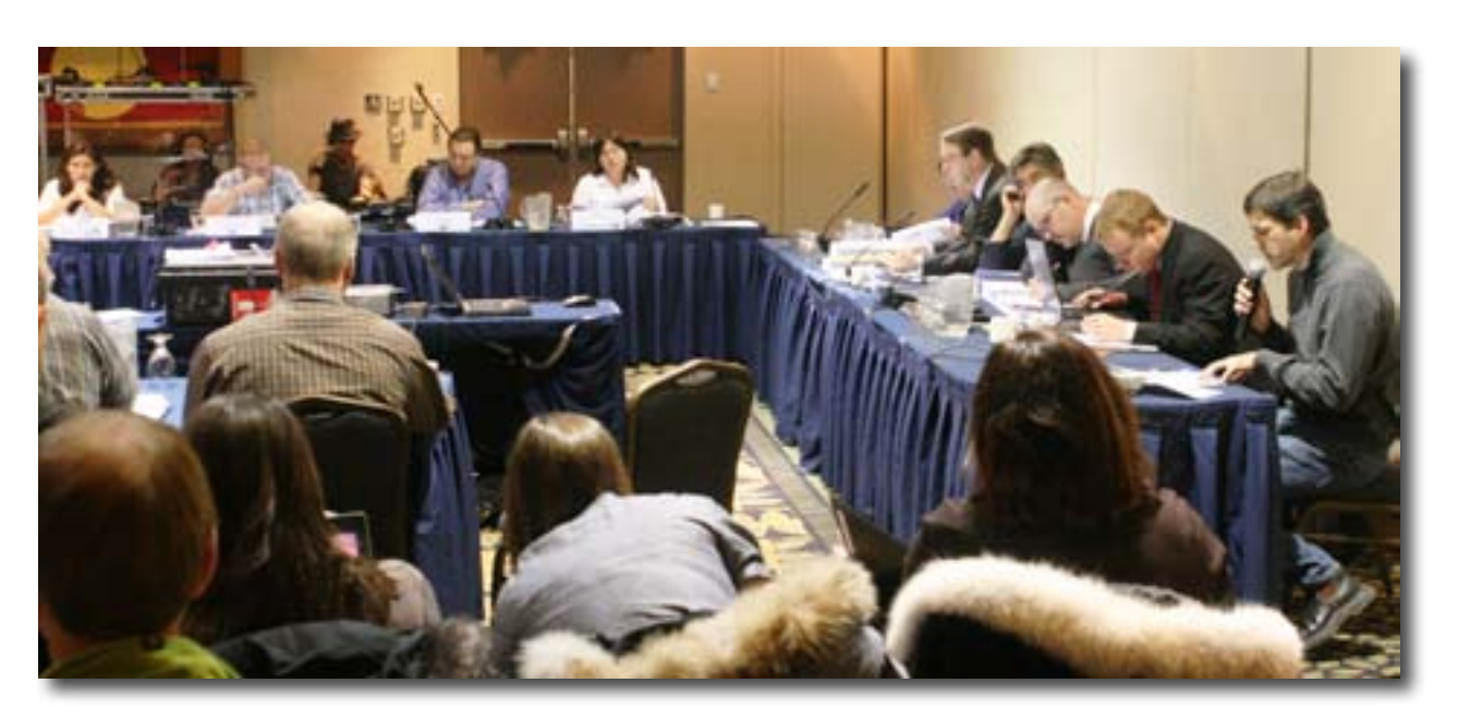
Day 3 of the De Beers Snap Lake Water Licence public hearing, Yellowknife.