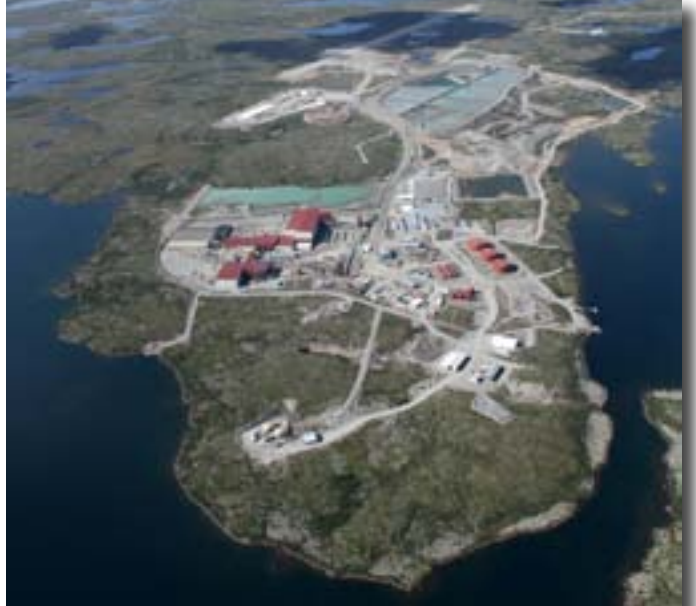
Snap Lake Mine, Snap Lake, NWT

Since June of 2011. staff and Board Members of the Mackenzie Valley Land and Water Board (MVLWB) have been working towards the renewal of De Beers Canada Inc.'s Snap Lake Type A Water Licence (WL) MV2011L2-0004. The De Beers Snap Lake diamond mine, located 220 km northeast of Yellowknife, was issued its first WL (MV2001L2-0002) by the MVLWB in 2004; it will expire on June 13, 2012.